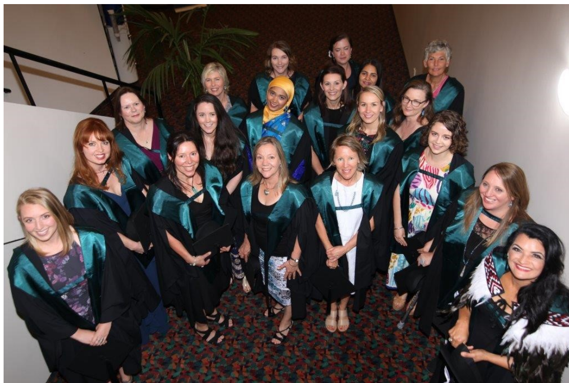
Above: the annual SPCNM Graduation Ceremony was held on 15 December 2017 at Waipuna Lodge, with all 19 students in the Bachelor of Natural Medicine 2017 cohort graduating.